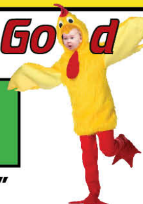
Benny "The Bird"