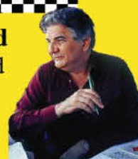
The real Jimmy "The Greek"